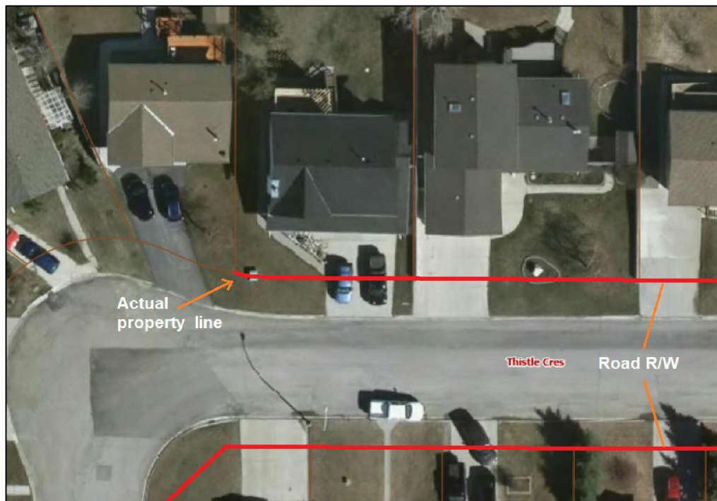
Illustration of actual registered road plan and right-of-way in relation to development on residential lots and where the property line is situated.